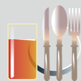
Food & Beverages