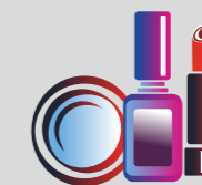
Personal Care & Cosmetics