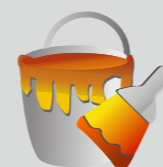
Paints & Coatings